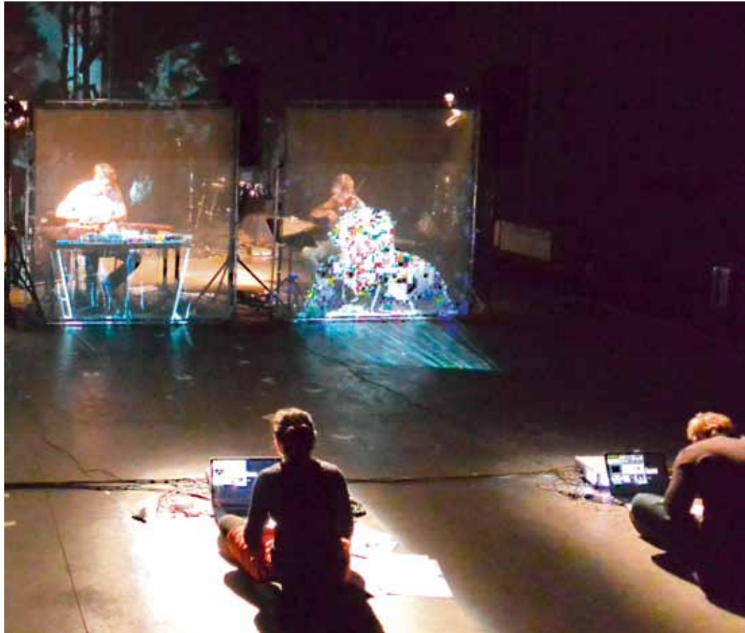
the screens, 4 video-projections.

tary aesthetic problem linked to the issue of the singularity mentioned above: the coexistence in one body of two (or more) completely alien identities. Even in a digitally enhanced body, there will always be something perceived as pertaining to the “self”, something “of its own”: in the same way, even to the most sophisticated computer software the basic, binary language will remain “its own”, fundamentally different from a system of chemical interactions in which the cells of the body communicate. However, in this extended post-human body these morphologically alien elements will be forced to reach some form of unity. In this series of aesthetic studies Prins explores at least three of such basic, internal relations: extension, supplementation and transformation.