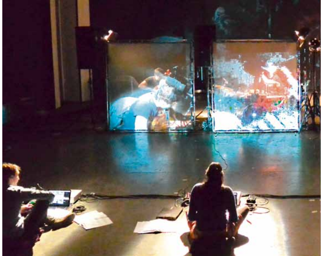
Nadar Ensemble performing "Generation Kill" at Platform Moskou 2013: 4 performers with gamecontroller, 4 musicians behind

At the same time digital capabilities allow for solutions that are much more radical than what was available only a few decades ago to other "gestural deconstructors" like Ferneyhough or Lachenmann.