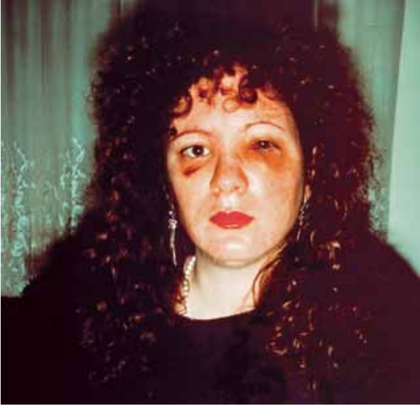
Nan Goldin: "Nan, one month after being battered (1984)". "[Nan Goldin's] use of high contrast, her impulsive compositions, and notably, her early move to color photography at a time (1973) when art photography was still largely synonymous with black and white indicate the cultivation of a self-conscious amateurish or vernacular style, a pleasing sloppiness that combines subtle aesthetic mastery with the appeal of the best off-kilter snapshot from a night of drunken carousing." Zurmomskis, Catharine, "Snapshot Photography: The Lives of Images", Cambridge: MIT Press, 2013, p. 246. © Nan Goldin, Matthew Marks Gallery, New York